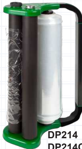
DP214 and DP214CL Litewrapper XT