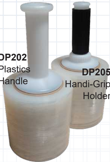
DP205 Handi-Grip Holder