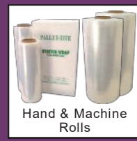
Hand & Machine Rolls