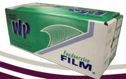
Cutterbox Films Pg.15