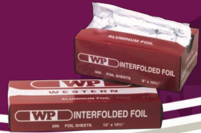
Interfolded Pop-up Sheets Pg. 17