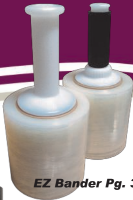
EZ Bander Pg. 3