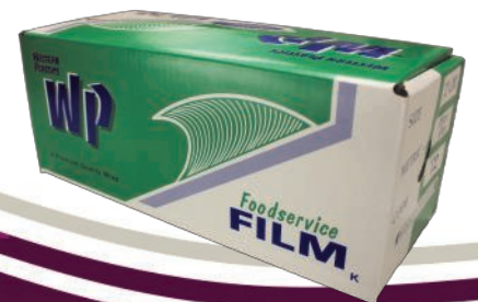
Cutterbox Films Pg.15