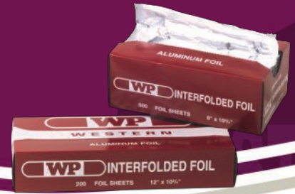
Interfolded Pop-up Sheets Pg. 17