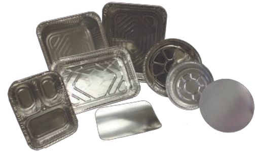
Foil Containers and Lids Pg. 19