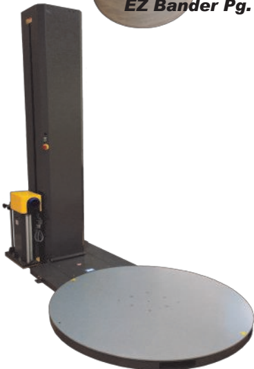
Evolution Wrapper Pg.10