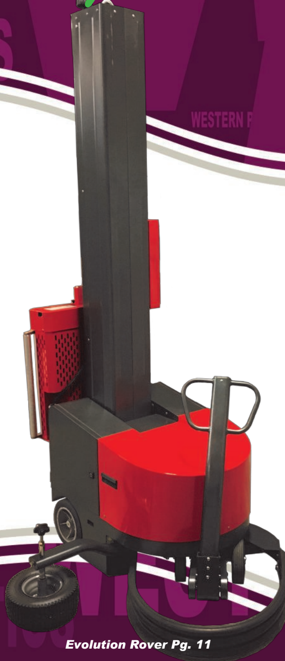
Evolution Rover Pg. 11